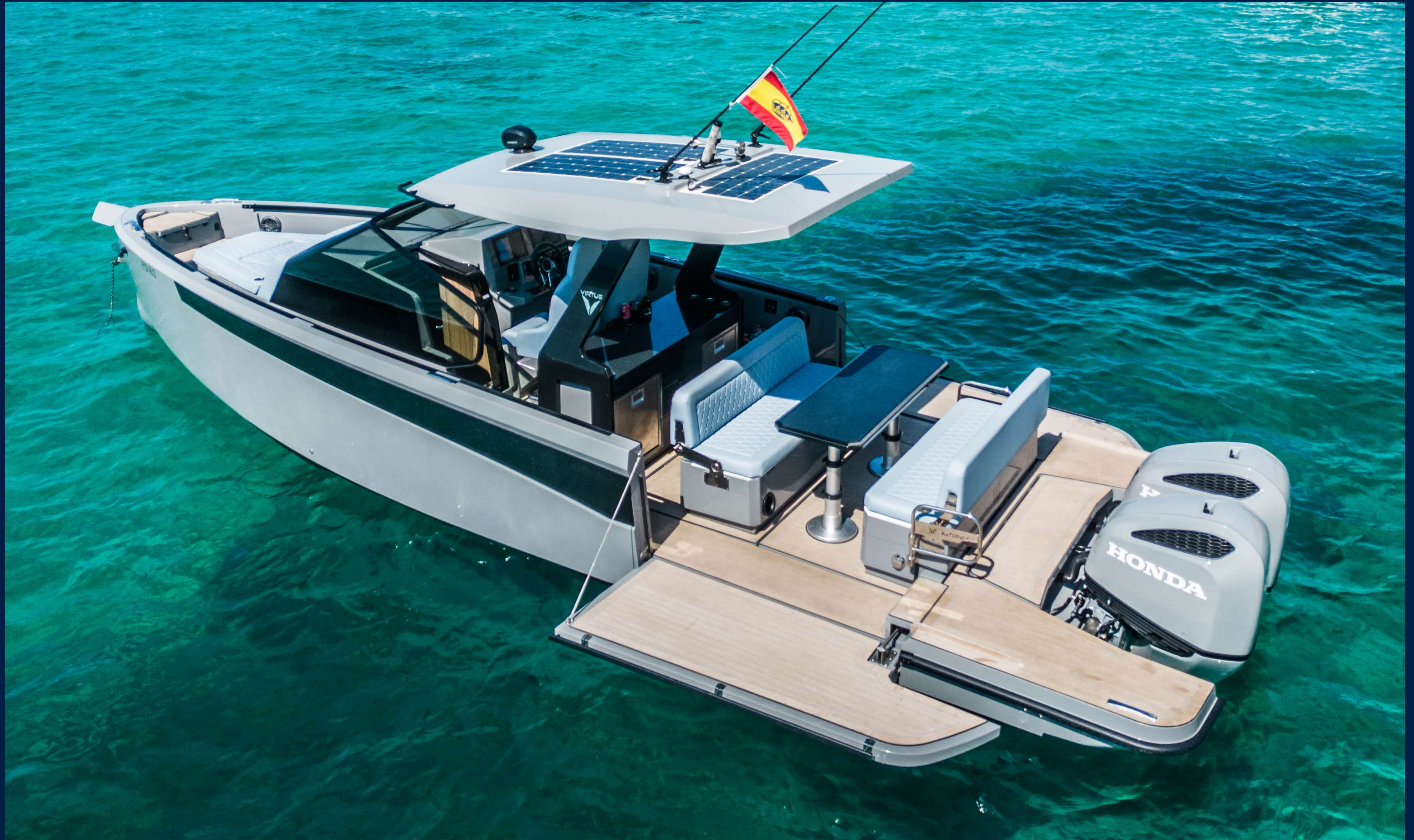
V I R T U E V 1 0