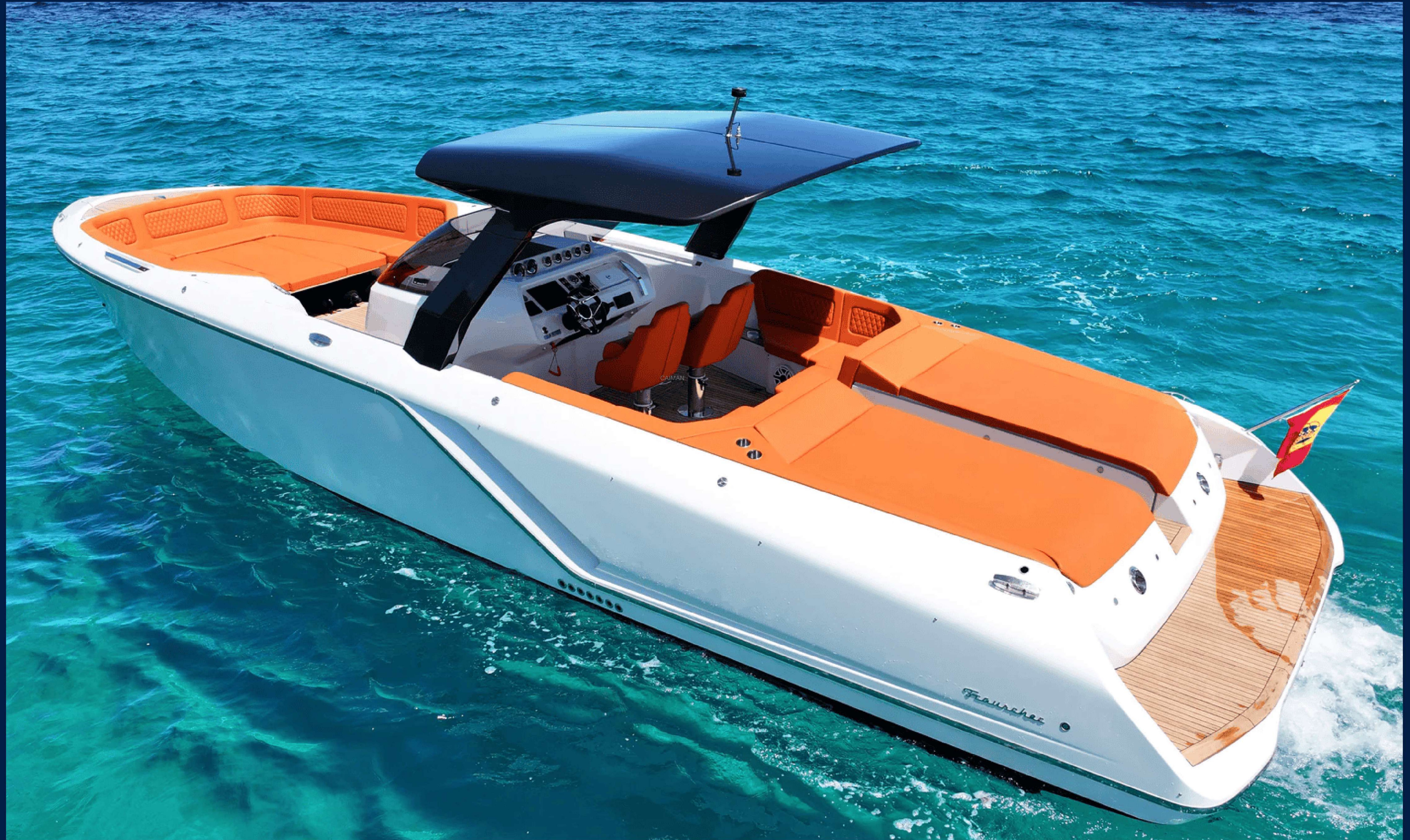
F R A U S C H E R 4 0