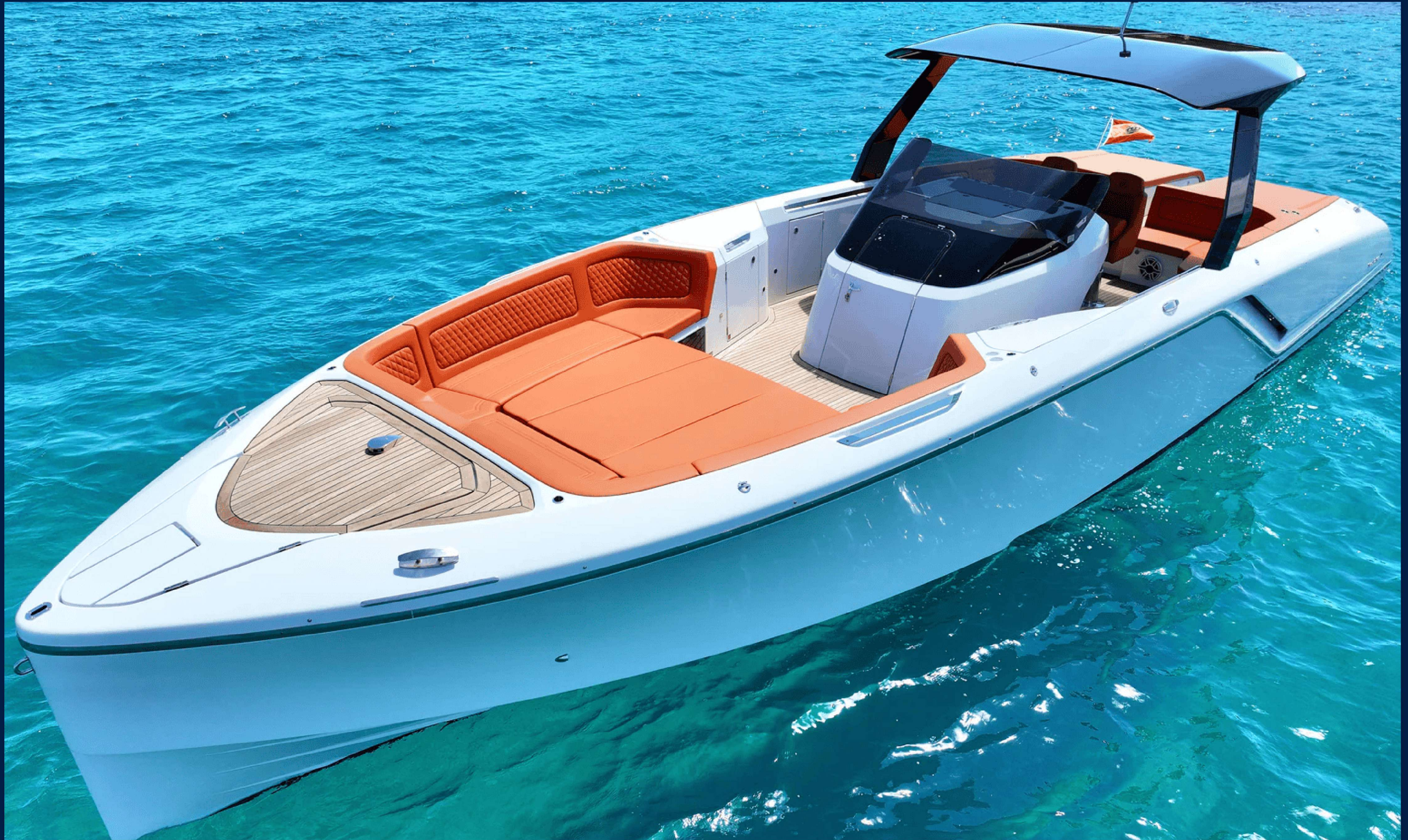
F R A U S C H E R 4 0