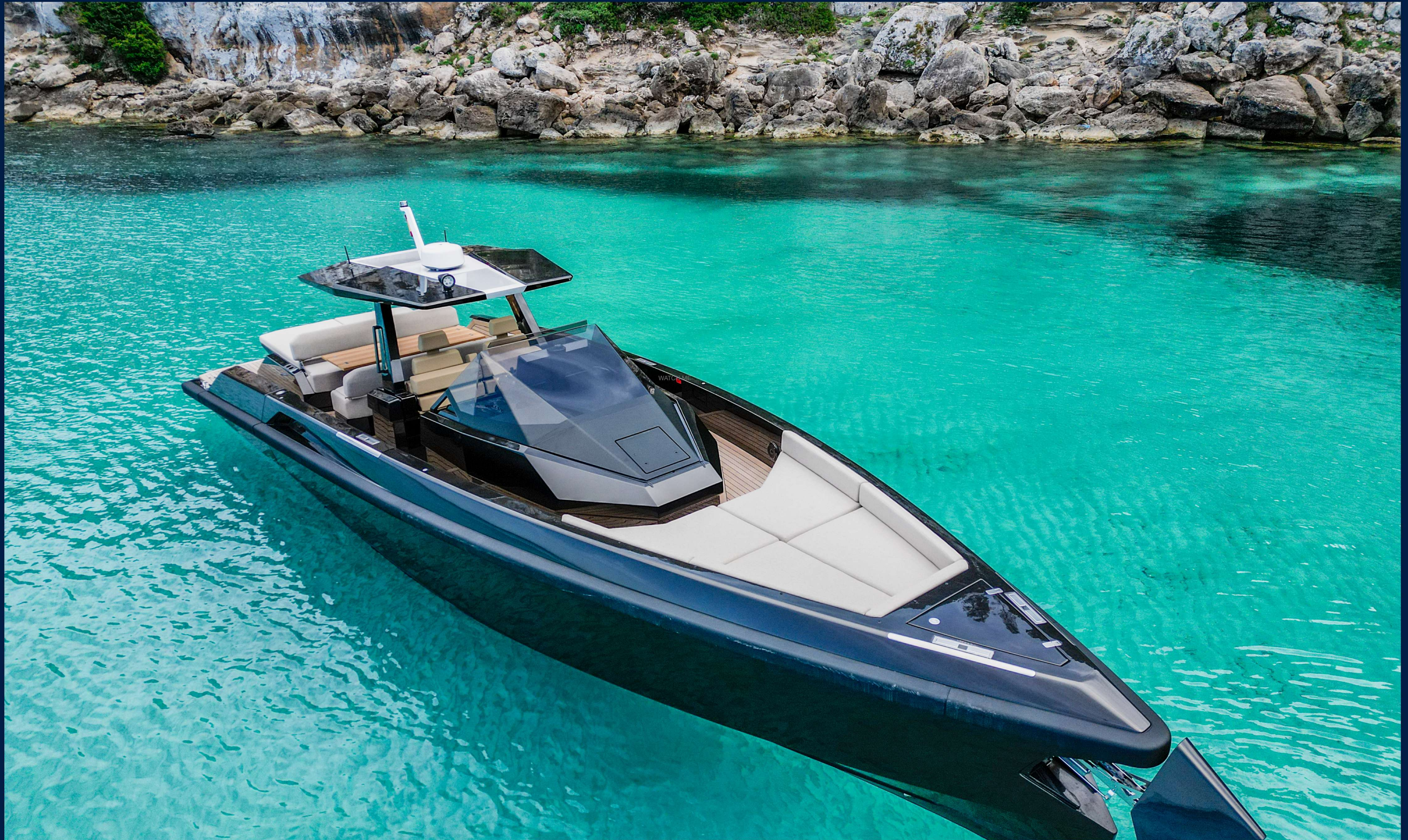
W A L L Y 4 8