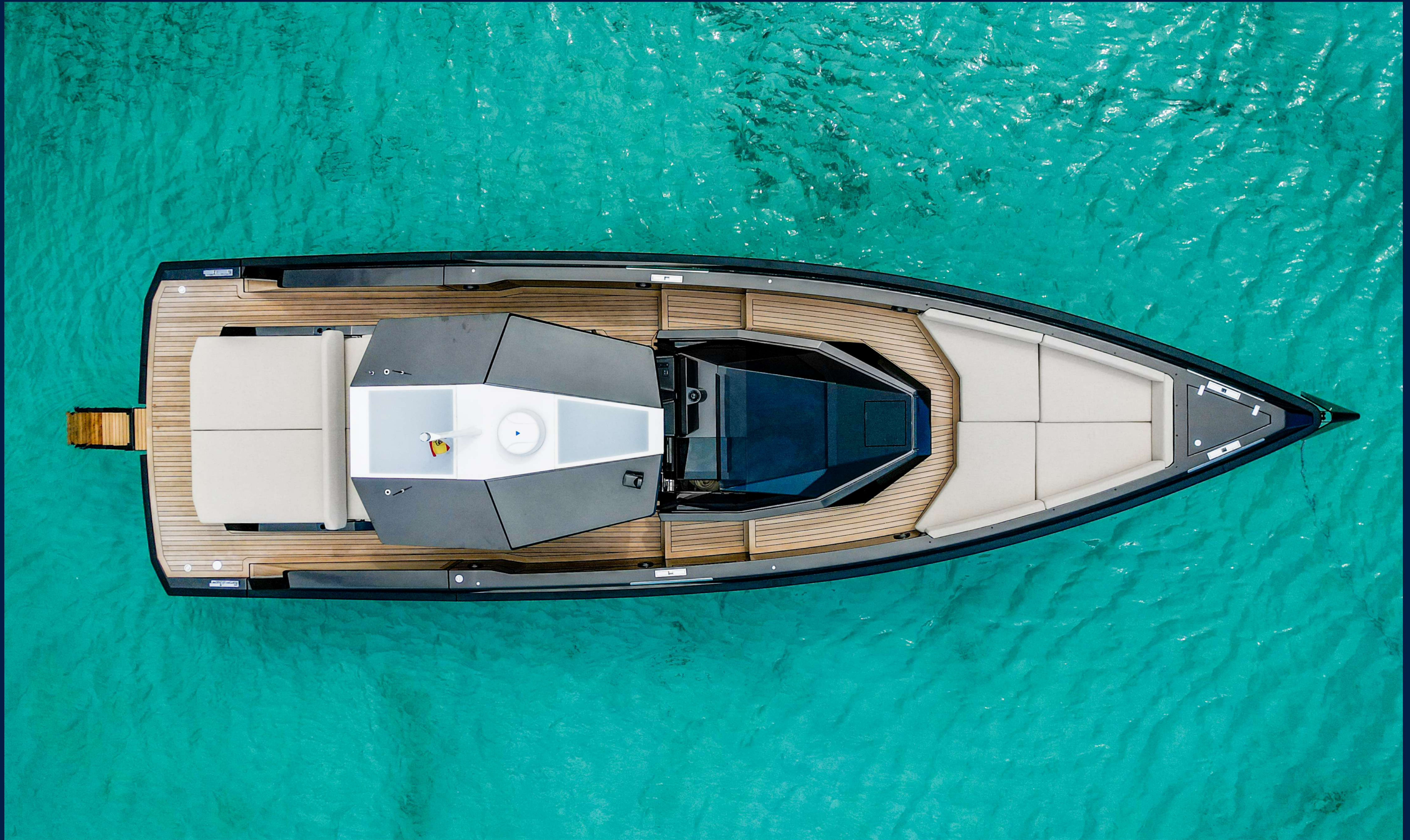
W A L L Y 4 8