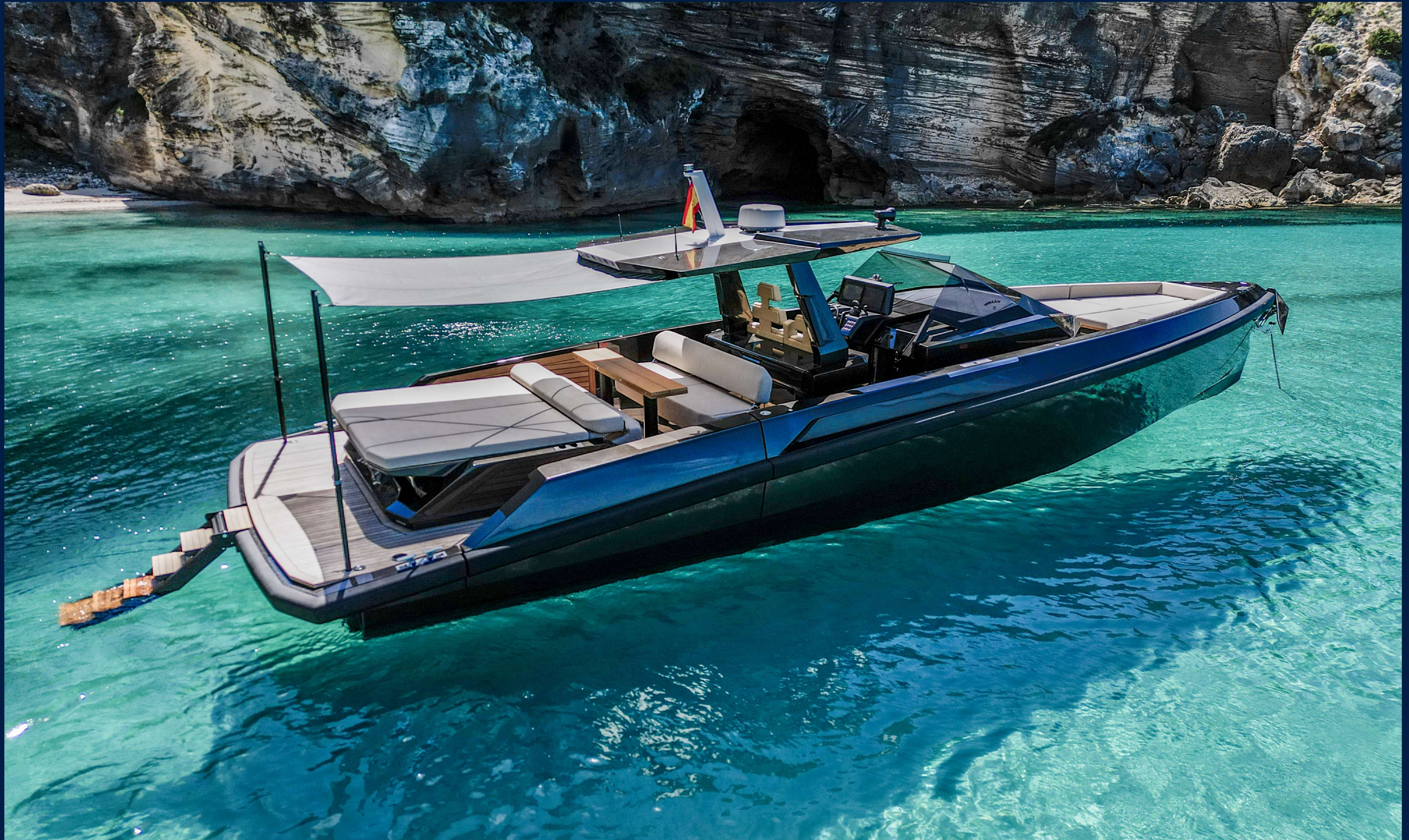
W A L L Y 4 8